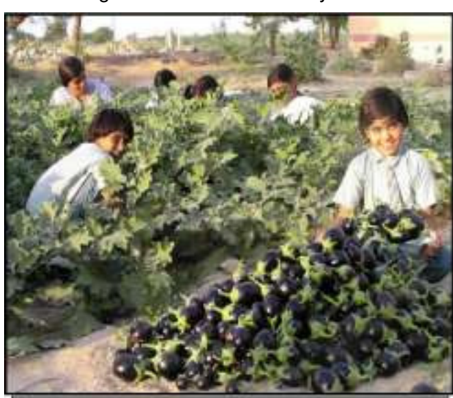
Physically challenged girls tending to the first crop of organically grown

The State Government of Rajasthan pays for 80% of the staffs' salaries; with the other 20% having to be raised by SKSN. The Government also provides just over £9.00 a month, per child, for all their meals, electricity, water, clothing & laundry, stationary, and medical expenses, but 10% of this figure has to be covered by SKSN.