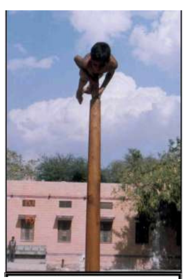
A disabled student performing an asana from the top of a 'Malkam' pole - a spo speciality from the State of

Sports allow individuals to experience the excitement of competition, the thrill of victory and the agony of defeat. These experiences help prepare individuals to face the adversity of a disability in their lives and to learn to bounce back in the face of challenge and change. Sports help push the disabled into lives that are motored by ambition and desire, fuelled by discipline, dedication and hard work - qualities needed to survive in a tough world, and particularly, in the harsh