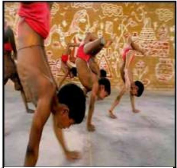
Hand-stand runs for the students during a physical education class.

more than just earning, commuting, worrying and yelling! The 'right to leisure' is as much a fundamental right as the 'right to education', if an individual is to achieve his full potential.