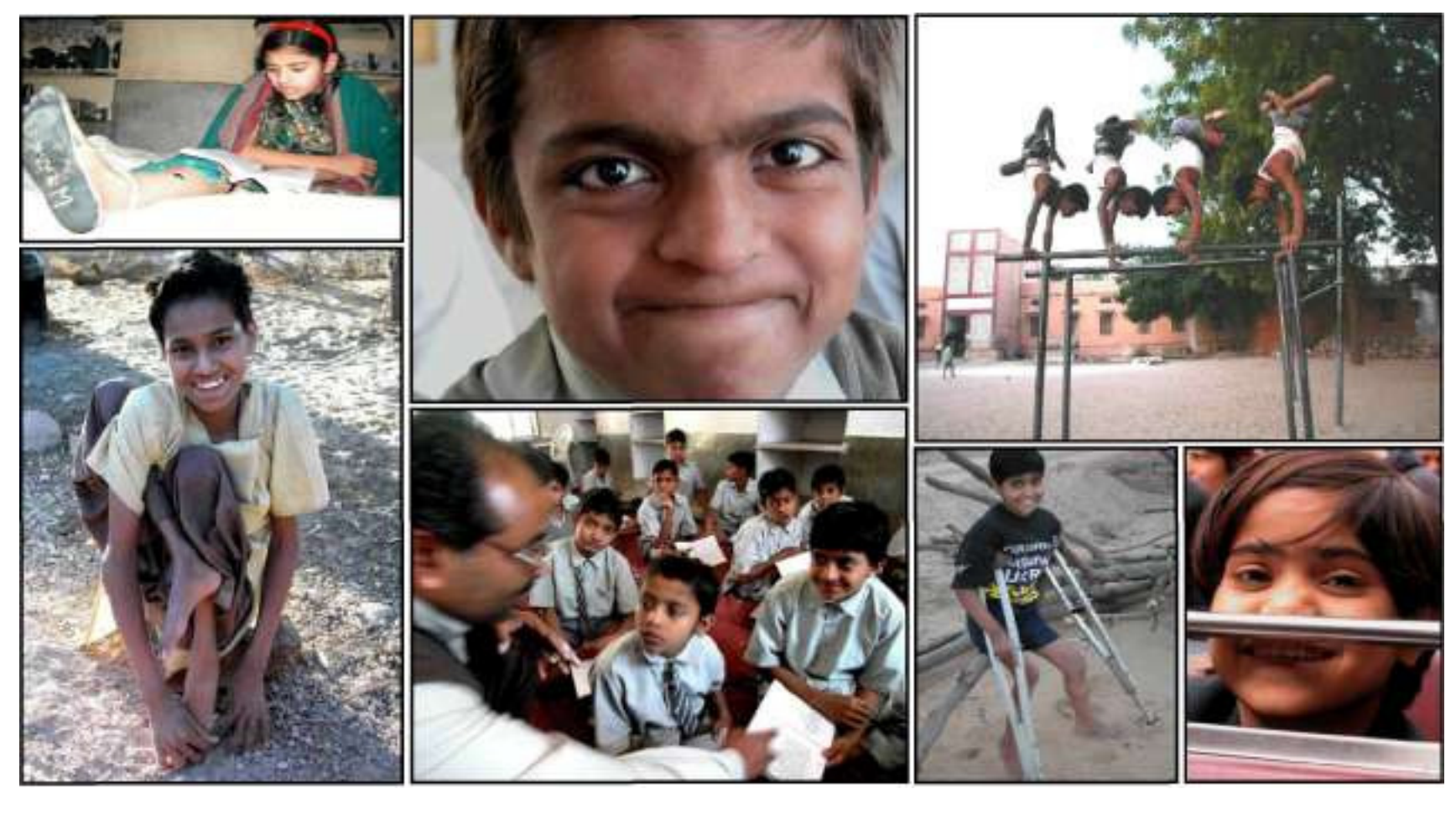
A School for the Disabled - Manaklao, India