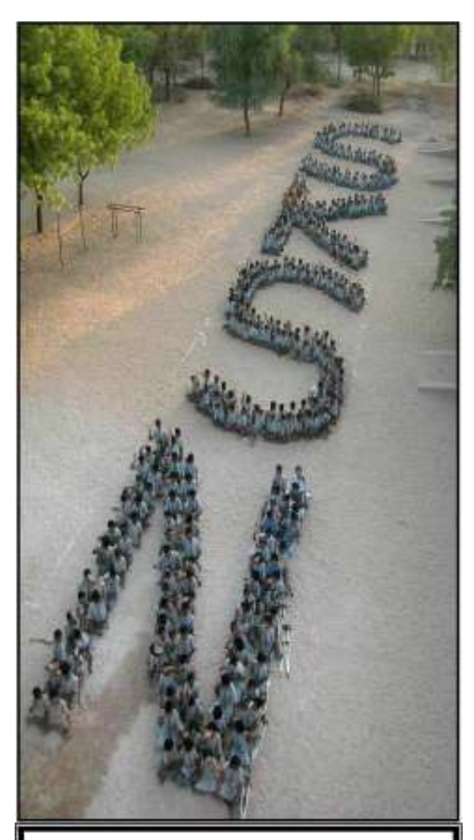
All 503 of the Sucheta Kriplani Shiksha Niketan students!!!!

Sucheta Kriplani is situated in the rural depths of Western Rajasthan, and on the fringes of the great Thar Desert. It's located