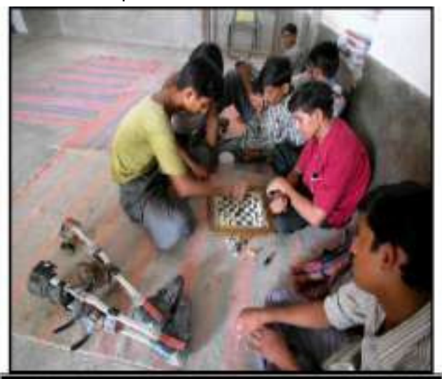
Leisure activities include chess and farming

Rather touchingly, some of the former students offer to send cash donations to the school, now that they are making small profits with their various businesses! To date, 150 children have passed out of Sucheta Kriplani.