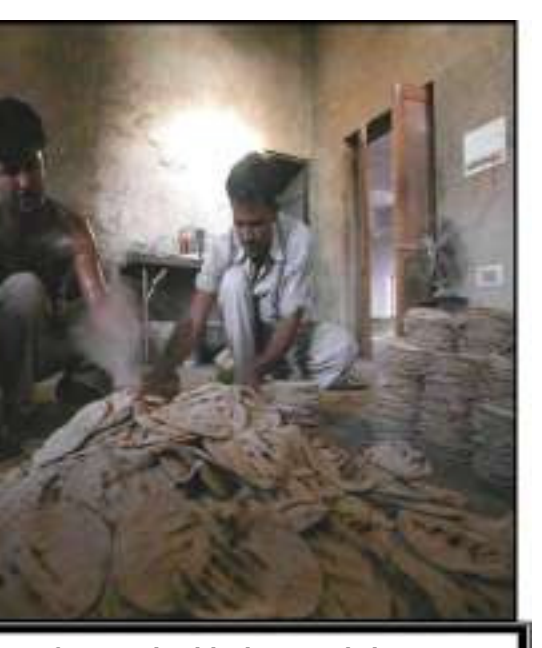
s from the kitchen and the ng room.